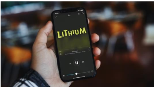
SiriusXM Now Playing Lithium Screenshot (Left)